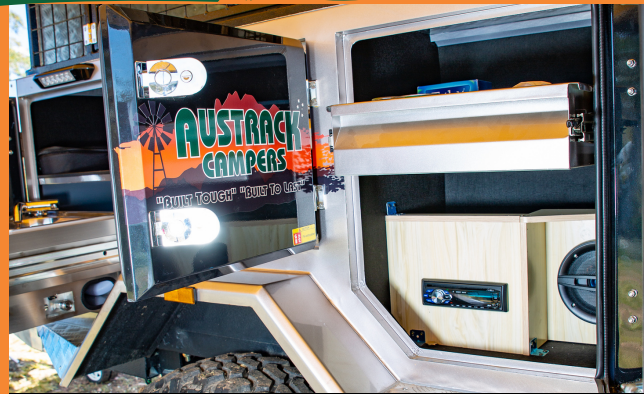
Large storage cage with 900 mm access doors.

*Bonus Inclusions do not make up part of tare weight.