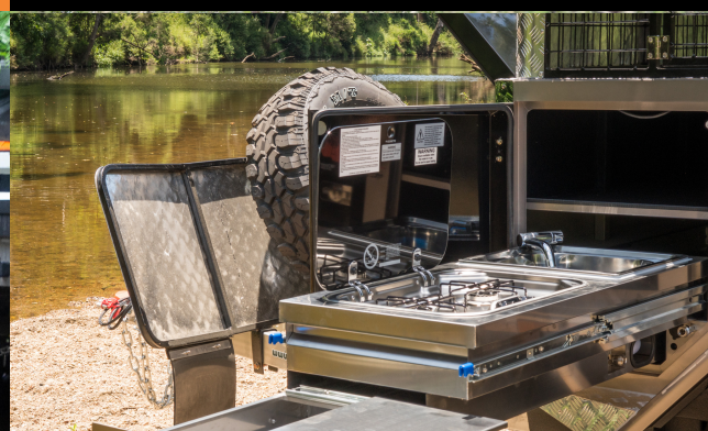
Slide out stainless steel kitchen with drawers, electric pump, tap, large sink & multi burner stove.