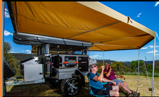
Full 270 degrees wrap around awning including walls.