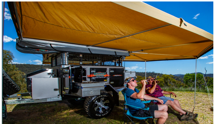
Full 270 degrees wrap around awning including walls.