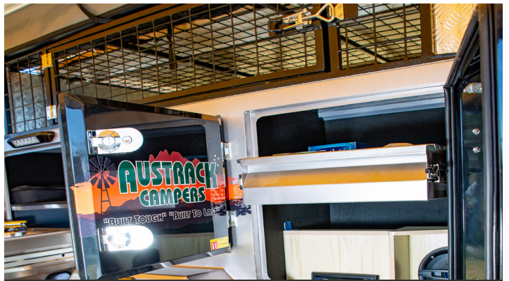
Large storage cage with 900 mm access doors.