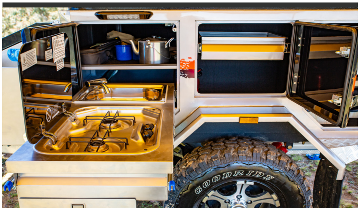
Slide out stainless steel kitchen with drawers, electric pump, tap, large sink & multi burner stove.